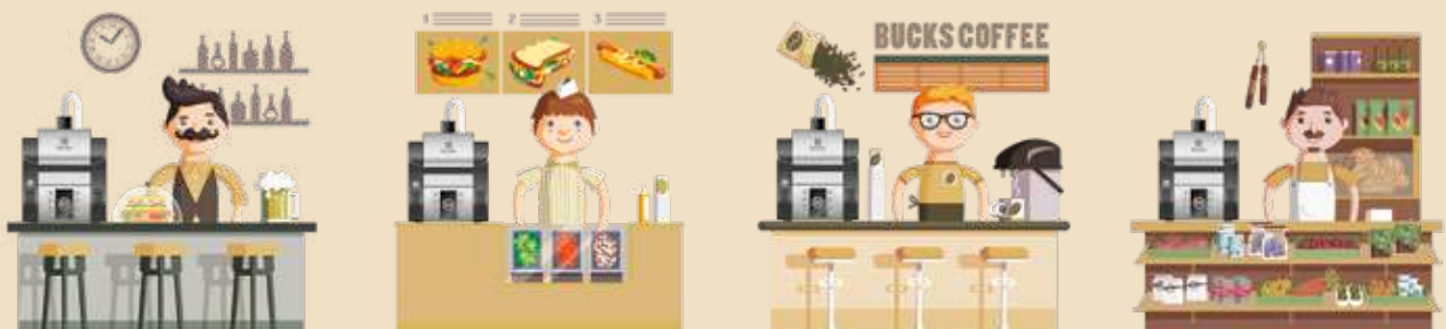
PUBS & BARS

Meet our friends and see how SpeeDelight has made them happier than ever!