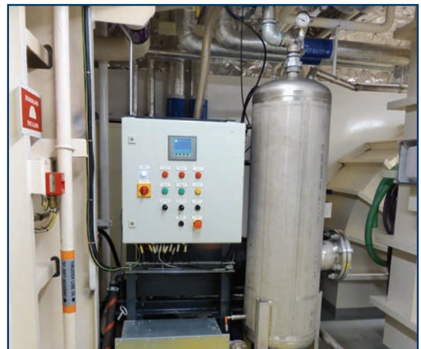
On board installation of Vacuum unit VU-65.