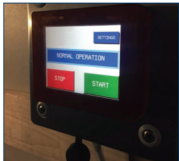
GDU-50 Operating panel