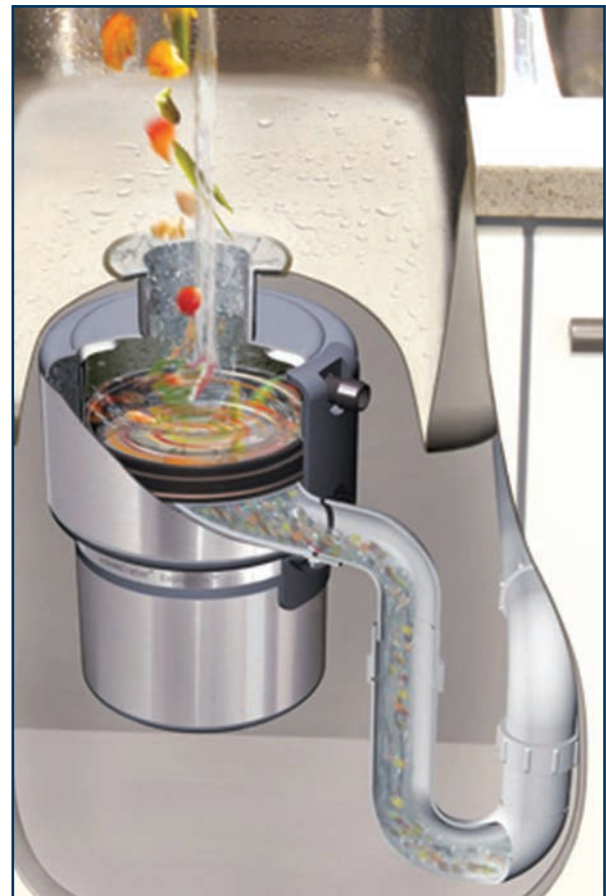
Food waste disposer.

A disposer with a rating of 4 kW or higher can easily handle larger items, such as normal-sized bones. The smaller units (< 1 kW) are normally installed in households and tend to get jammed easily.