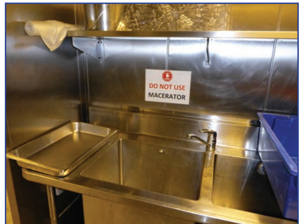
Normal situation on board a vessel - "Do not use macerator"...

The rotary grinder/shredder can jam if certain food waste or non-grindable objects become fastened. A piece of bone, fibrous material (artichokes, corn husks, onion skins), utensils, etc. are examples of what can jam the disposer.