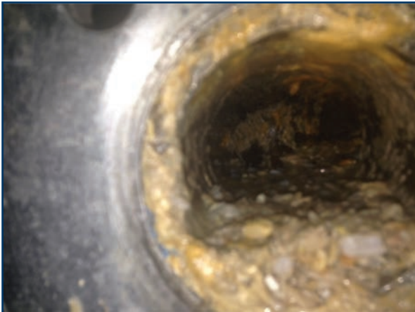
Clogged drain pipe

The main reason for this is that the velocity of the ground food waste in the piping system is too low.